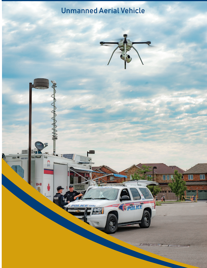
Unmanned Aerial Vehicle