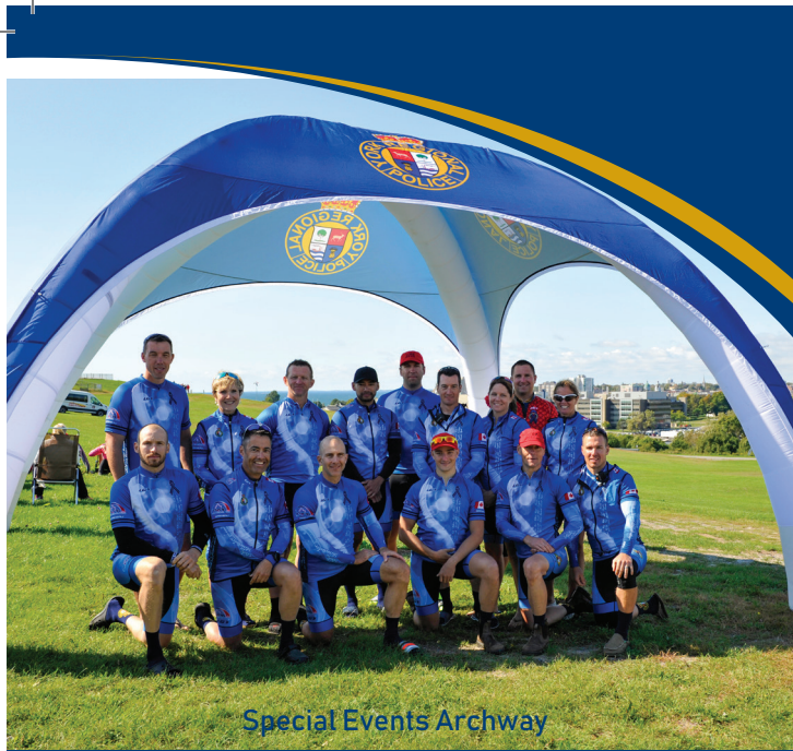
Special Events Archway