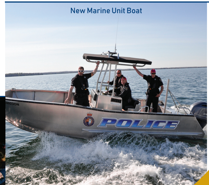
New Marine Unit Boat